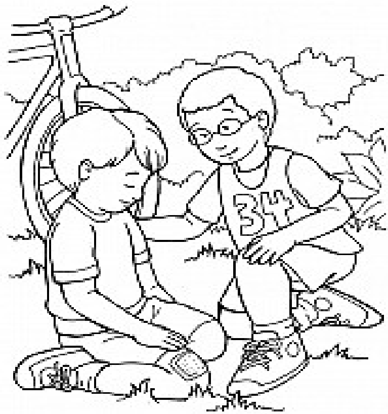
I can follow Jesus by helping others.